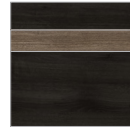
Ebony/ Timber Premium