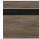
Timber/ Ebony Premium